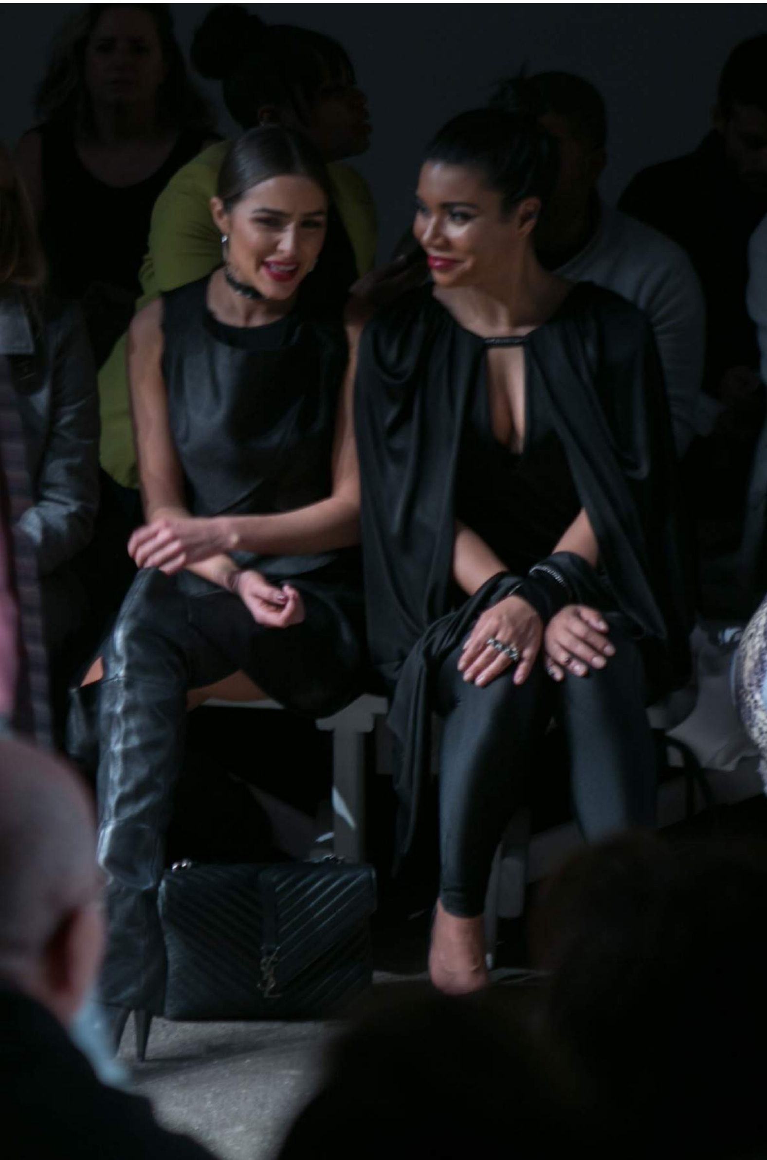
📷 OLIVIA CULPO 4.3 M FOLLOWERS