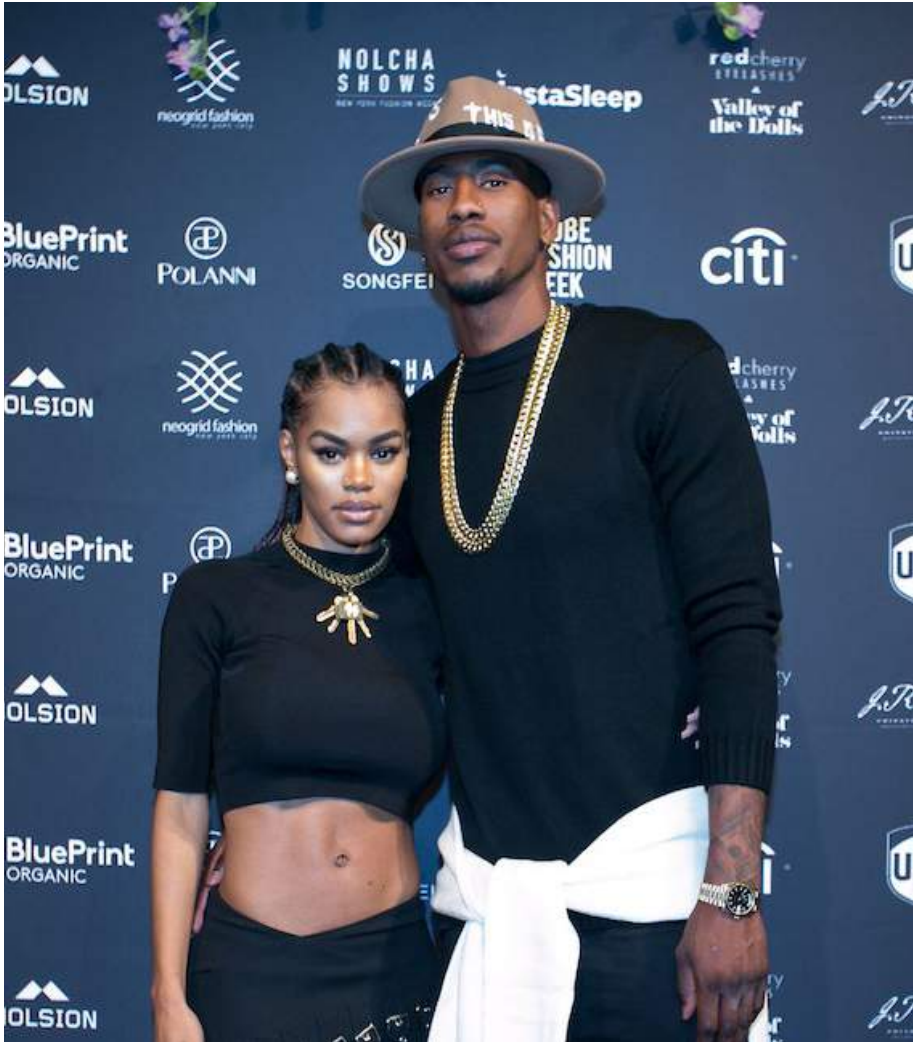
Teyana Taylor Iman Shumpert