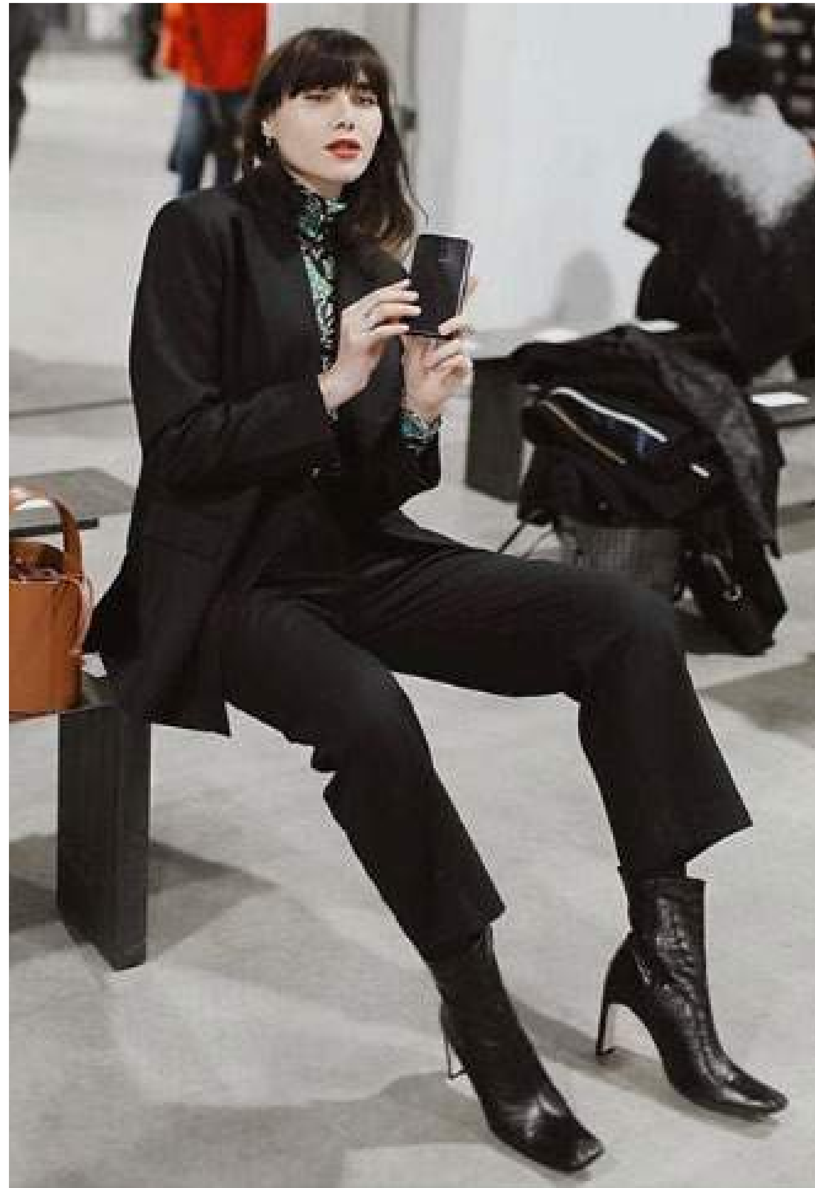
📷 NATALIE OFF DUTY 636K FOLLOWERS