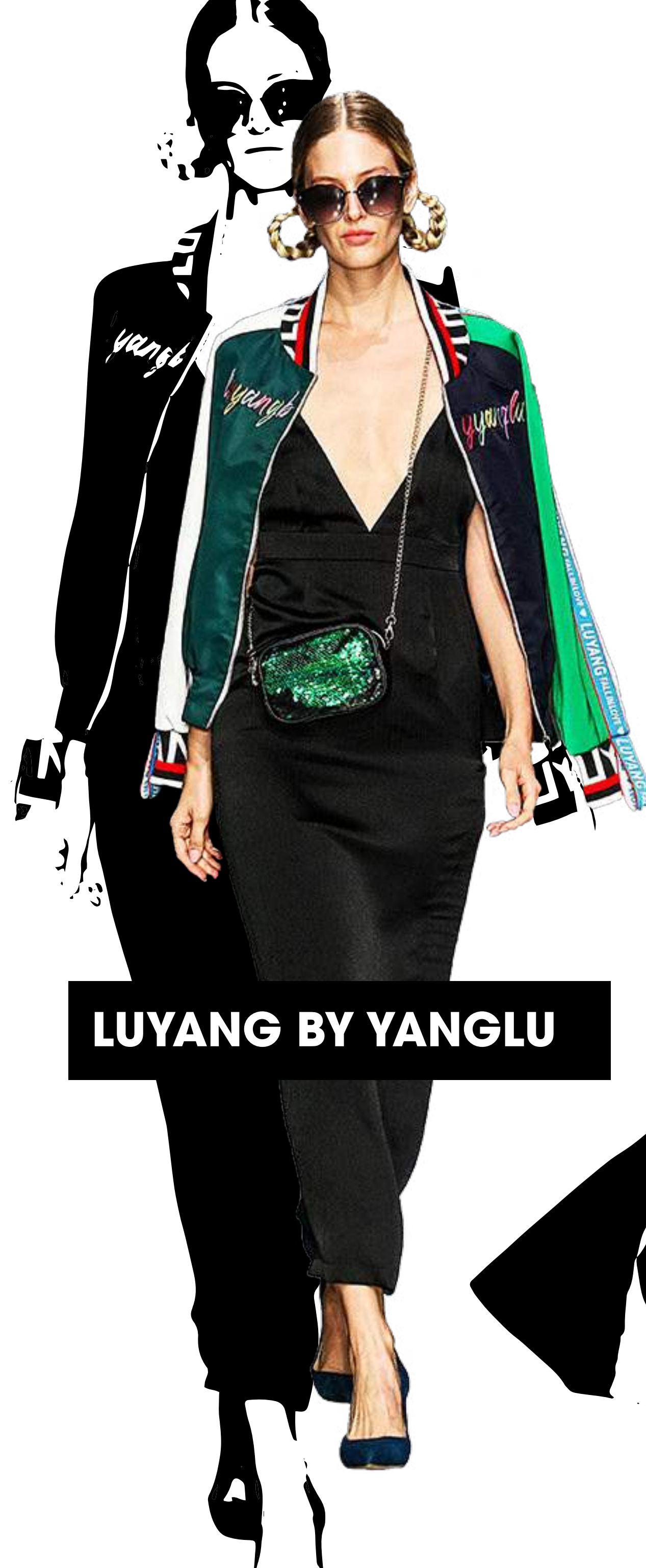
LUYANG BY YANGLU

Countries include Italy, Australia, Israel, USA, England, Mexico, Peru, Lebanon, Turkey, Iceland, Nigeria, Poland, Russia, Spain, Saudi Arabia, Canada, Brazil, South Korea, Colombia and China.