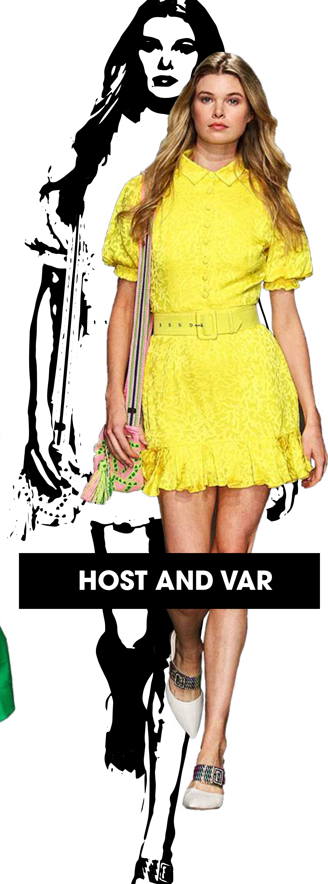
HOST AND VAR