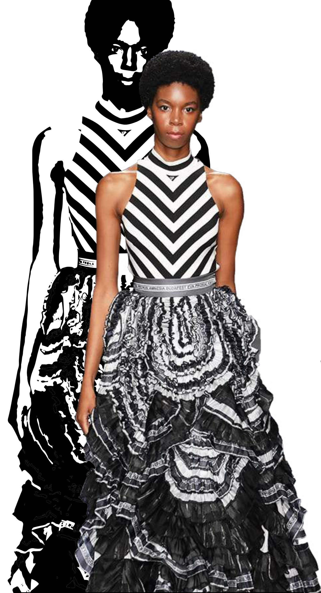
AMNESIA BY EVA PROKAI